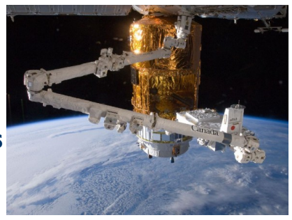
NASA photo of Canadarm2

Canada's robotic Canadarm2 will be installing